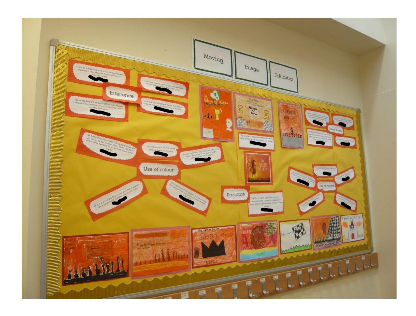
Appendix 10: Class frieze of moving image education topic, "Queen of Katwe"